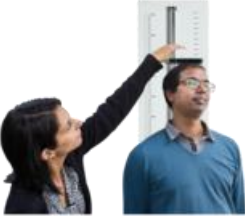
Check your height